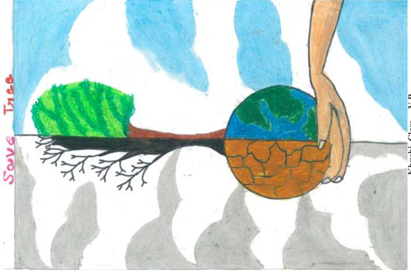
Khushi, Class - VB