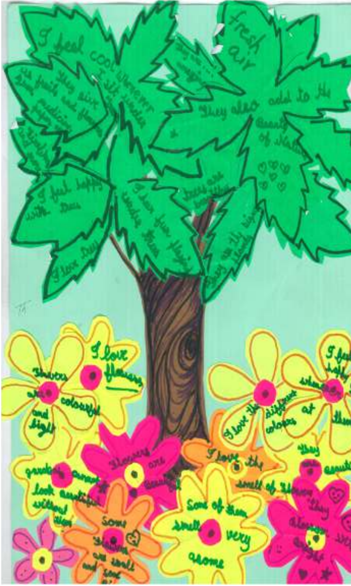
Thoughts from, Class - II-B